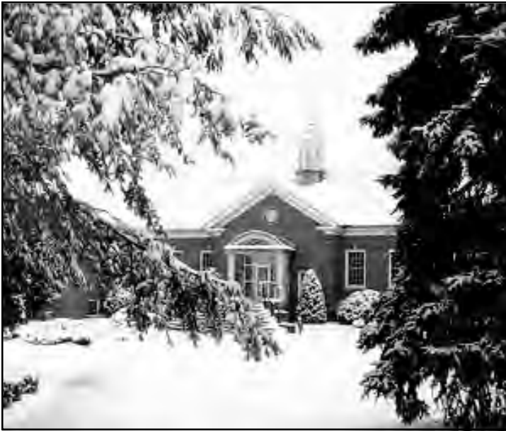
Elizabethtown College campus is noted for its natural beauty both in the winter as well as the warmer months.

No transcripts are furnished to anyone whose account is not paid in full. There is no charge for transcripts.